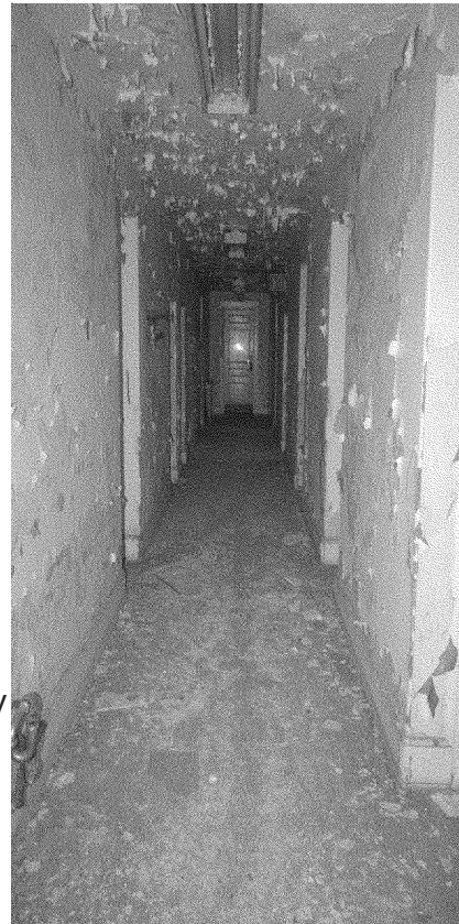
Currently traversed by bats and raccoons, 2008 will move the vision of this hallway as a common space for families and volunteers forward.

n'Deavor. There will be much to do in 2008. We relish the challenge and opportunity to move ahead both with the fundraising and the project itself. The team has been